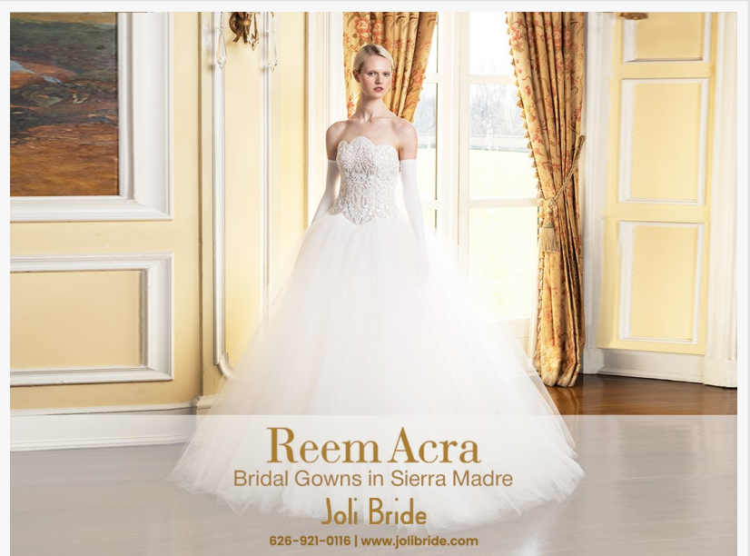
Reem Acra Bridal Gowns

In addition to alterations, the boutique provides custom design services. This option allows brides to collaborate on the creation of a gown that reflects their personal ideas and preferences. From incorporating unique details to designing a completely original dress, these services offer flexibility for brides who seek a more personalized approach to their wedding attire.