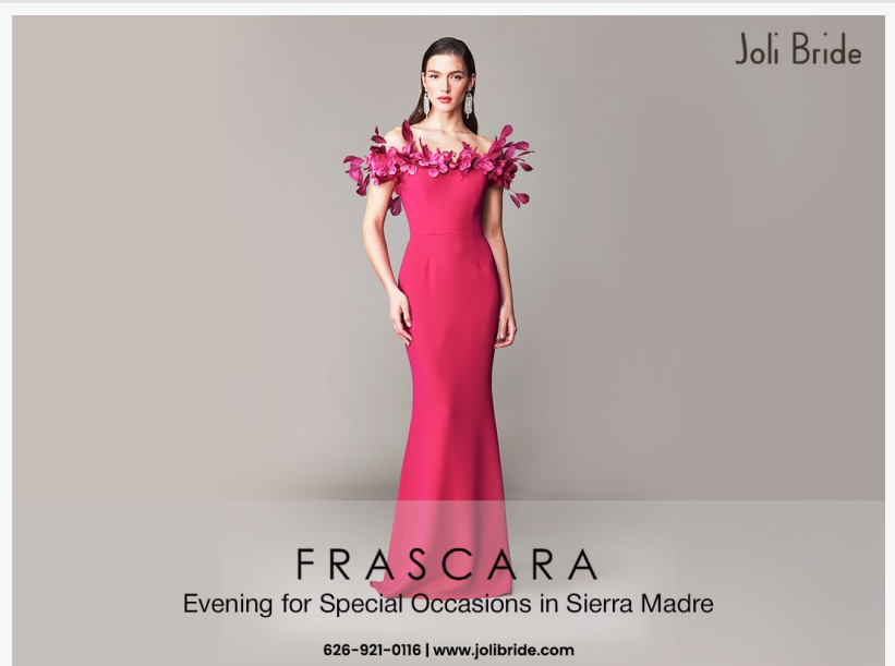
Frascara Evening for Special Occasions

The boutique offers a personalized shopping experience for brides. Appointments are tailored to meet individual needs, allowing for a structured process that adapts to each bride's