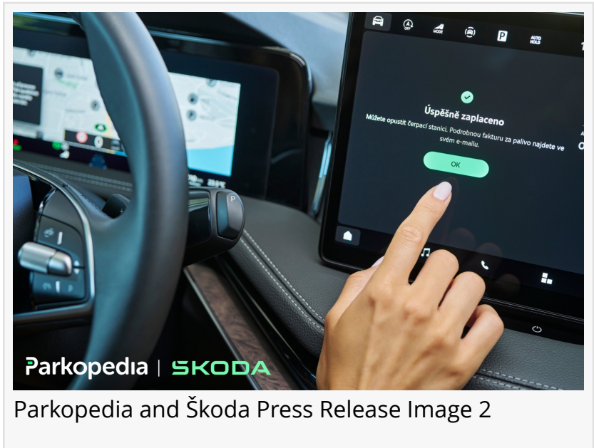
Parkopedia and Škoda Press Release Image 2

*- Škoda Pay to Park and Pay to Fuel are available in the following European countries. Pay to Park: Czechia, Germany, Denmark, Finland, Norway, Sweden, Belgium, Switzerland, Austria, Hungary, Slovenia, France, Spain, Netherlands, Italy and Portugal.