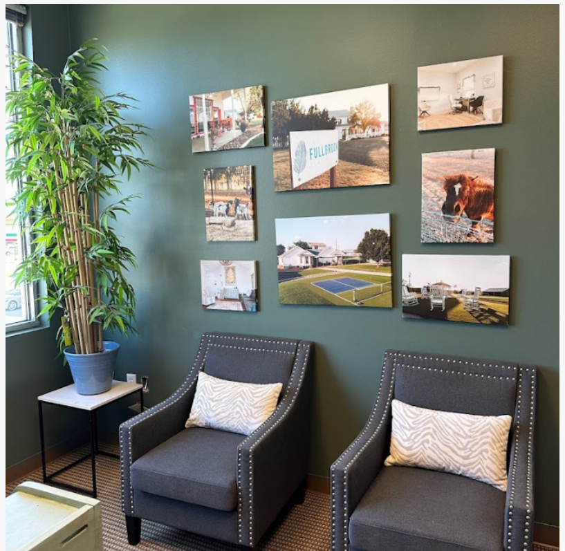
The Fullbrook Center Lobby