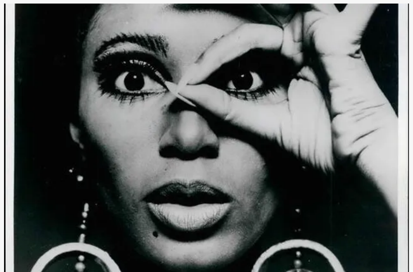
Donyale Luna: Supermodel, Best Documentary / Portrait