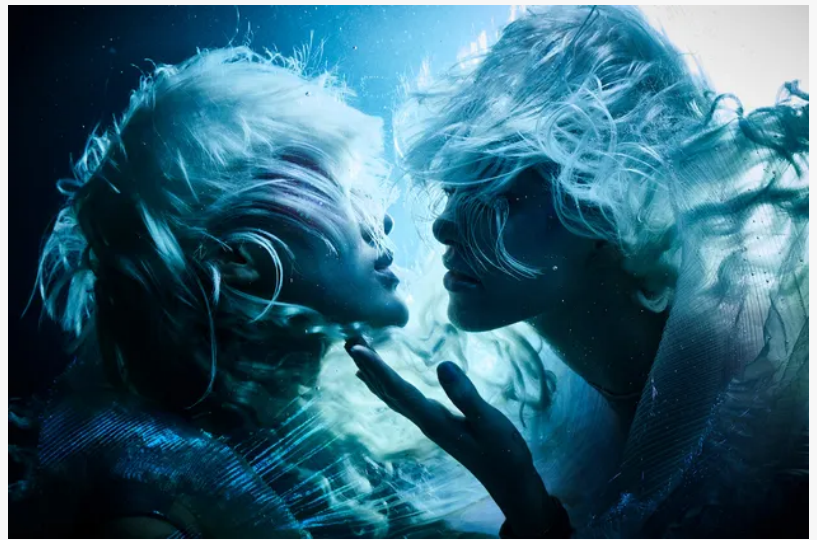
Mesmerising Jellyfish Dancing in the Moonlight, Canon India