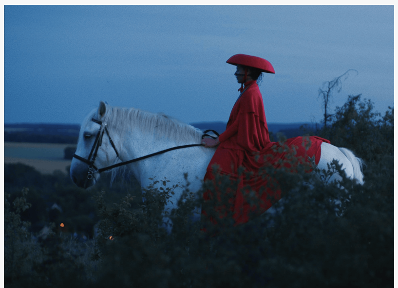
Eden, Best Speculative