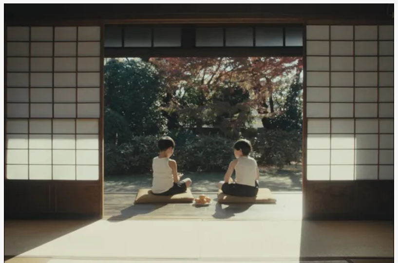
Pièces Uniques, Best Experimental

Jürgen Berlin fashion Film Festival press@berlinfashionfilmfestival.net