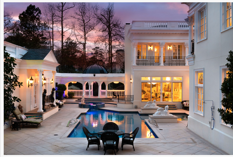
Walkout pool and spa terrace with expansive gardens for entertaining

Property and opportunity details provided by seller or others; buyer to verify. Agents will be compensated according to the terms and conditions of the Listing Agreement. See Auction Terms and Conditions for full details.