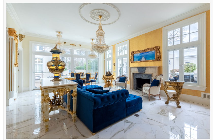
Fully updated smart home with luxurious finishes and high-end features

opulence. Even amidst all this Old-World charm, the residence comes equipped with modern appliances and conveniences, functioning as a "smart home" for modern living.