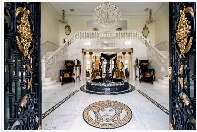
Elegant two-story marble entry hall with fountain and grand staircase

architectural authenticity and intricate design make it far more than a residence; it's a piece of art, and for a property of this caliber, reaching a truly discerning audience is key. Sotheby's