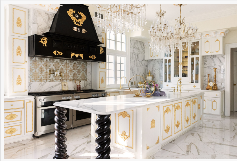
Magnificent Le Petit Trianon-inspired Atlanta estate on 2.62 gated acres

Beyond functionality and versatility, the estate is an aesthetic wonder whose interior design captures the timeless elegance of the great European palaces. Finely crafted chandeliers float above gilded fixtures, while polished wood and lacquered marble furnishings set a tone of thoughtful