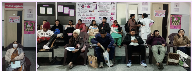
Patients and Visitors in the Clinic Area.