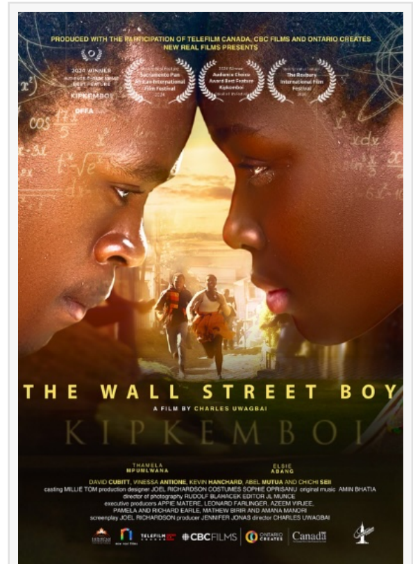
The Wall Street Boy, Kipkemboi

Diarah N'Daw-Spech ArtMattan Films 212-864-1760 email us here