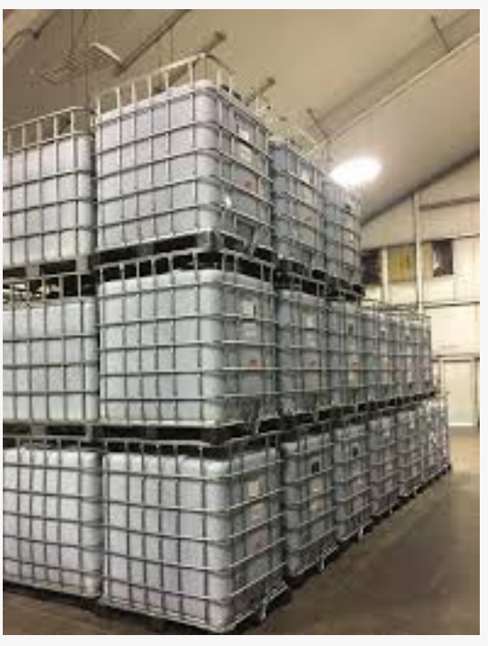
Flextank systems help wineries reduce expenses, and scale and expand their operation.

This press release can be viewed online at: https://www.einpresswire.com/article/766201013