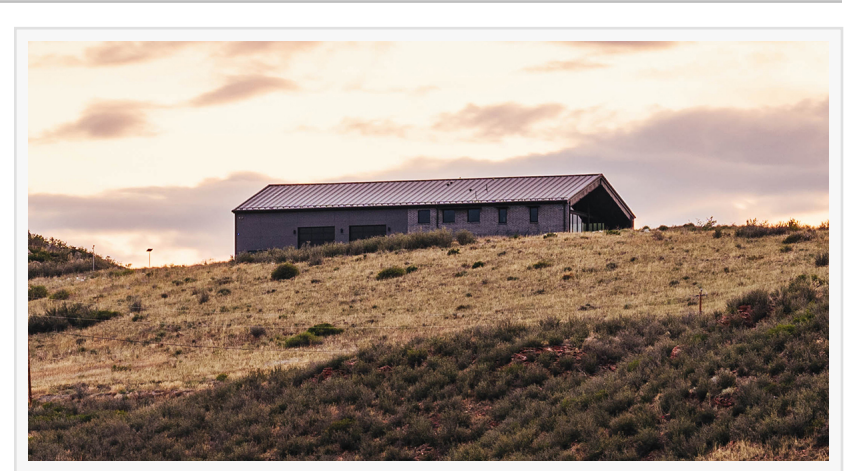
6502 Kiva Ridge DR Berthoud, CO 80513

BERTHOUD, CO, UNITED STATES, December 4, 2024 /EINPresswire.com/ -- A rare and exceptional opportunity has arisen in the heart of Northern Colorado. This majestic 7,772 square foot luxury estate, situated atop 35 acres, offers breathtaking 360-degree views of the Front Range. The property, known for its architectural detail and industrial design, is now available for purchase.