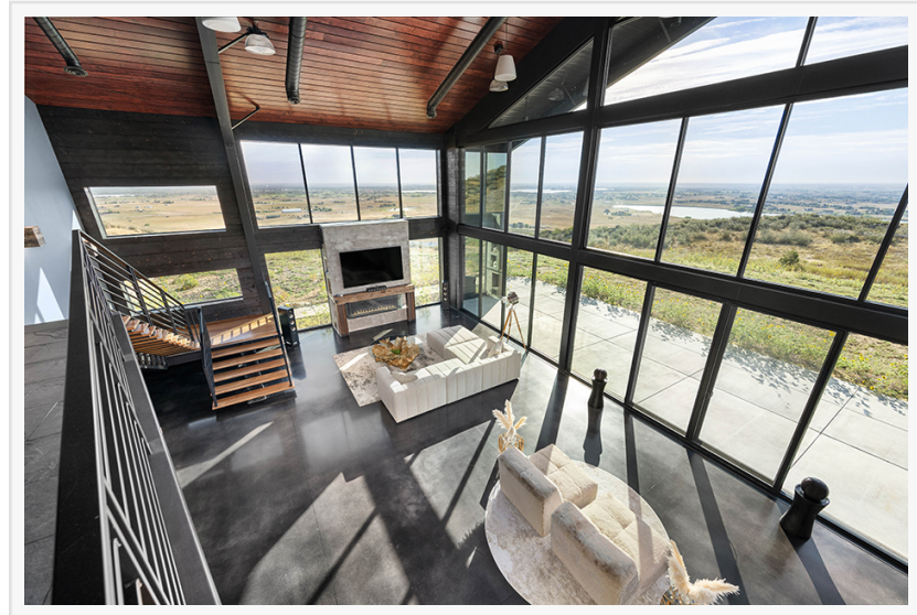
Birdseye view of the living room at 6502 Kiva Ridge