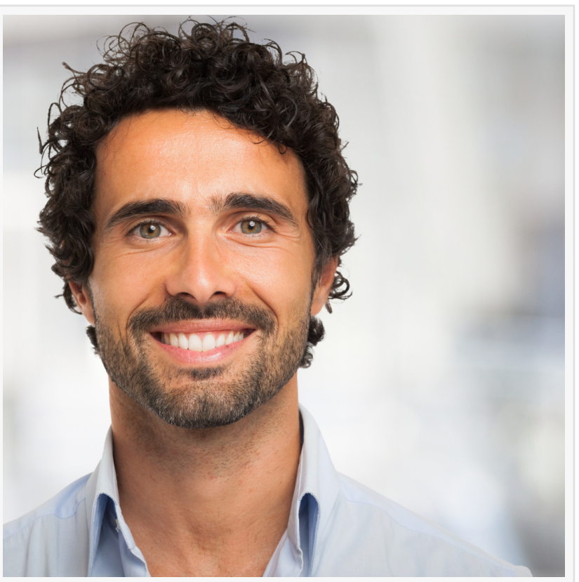
Cosmetic Service Dental Discount Plans

For more information about American Dental Care's healthcare accessibility initiatives, visit americandentalcareinc.com or call 713-784-9696.