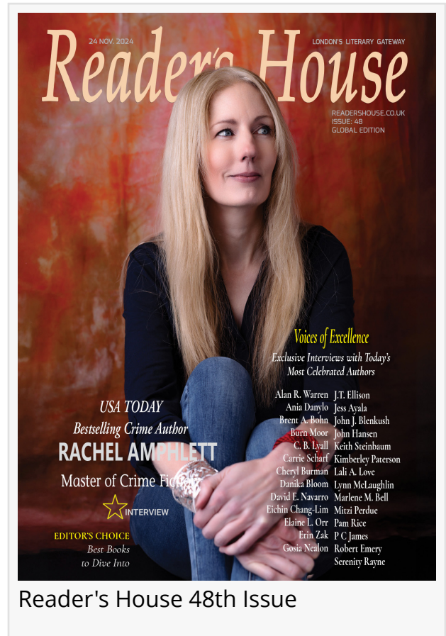
Reader's House 48th Issue

The author's fascination with ancient myths is evident in his writing. "The Solstice Series evolved from my 30-year love-fest with the mystical Mount Shasta," he shares. "It took eight years to write the series, to blend fantastical with relatable human experiences, which would seamlessly