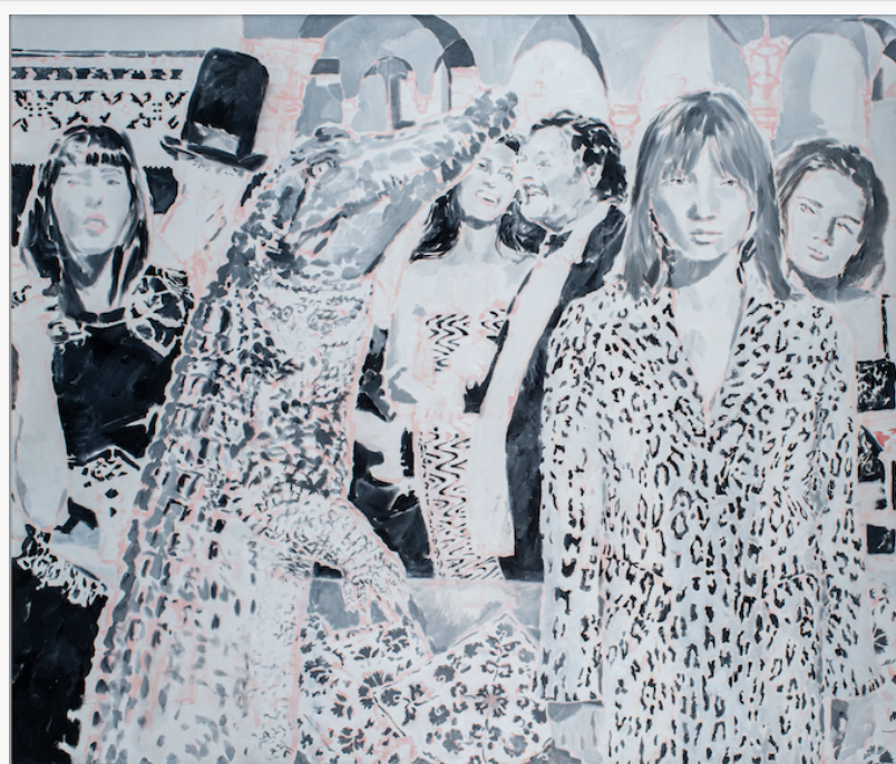
Crocodile in the House #1

For more information, visit https://artspeaks.com/ .