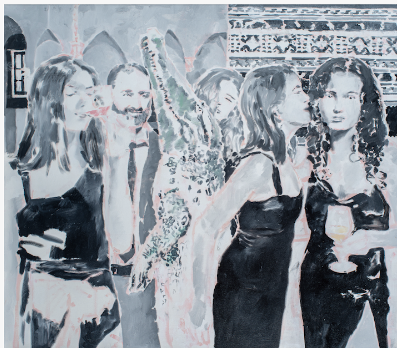
Crocodile in the House #2