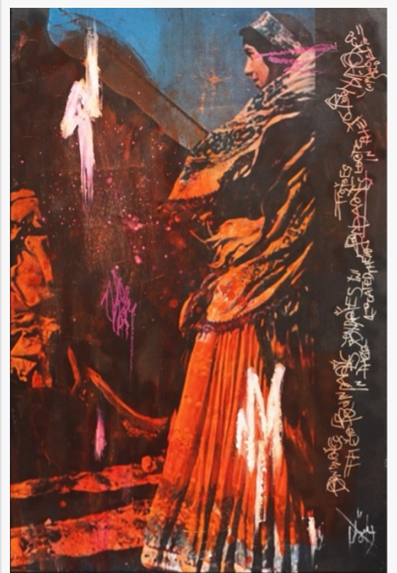
Nomads of Persia Panel II (Paintover Collection)

Instagram: @firouzfarmaian @nomadsofpersia