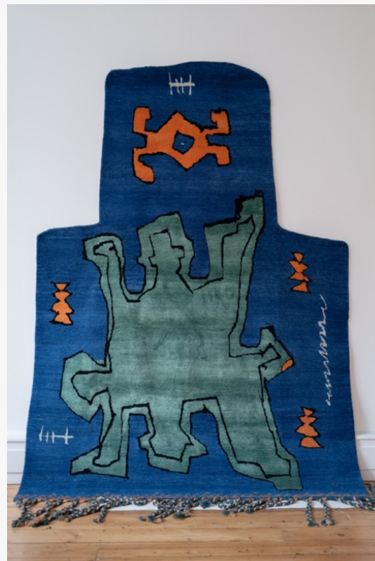
Khorjin Panel II (Varanasi Edition)