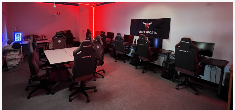
AndaSe CSR Initiative

Omaha (UNO) Esports program. This equipment contribution underscores AndaSeat's dedication to supporting collegiate esports development and creating optimal training environments for student athletes.