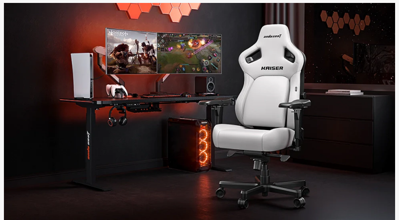
AndaSeat Chair CSR