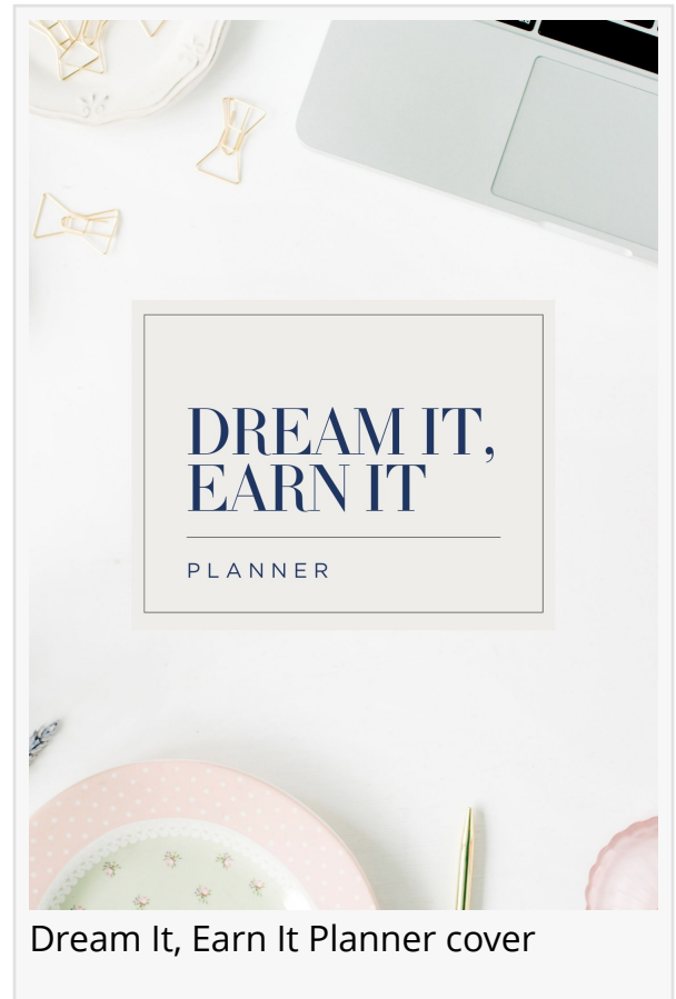
Dream It, Earn It Planner cover