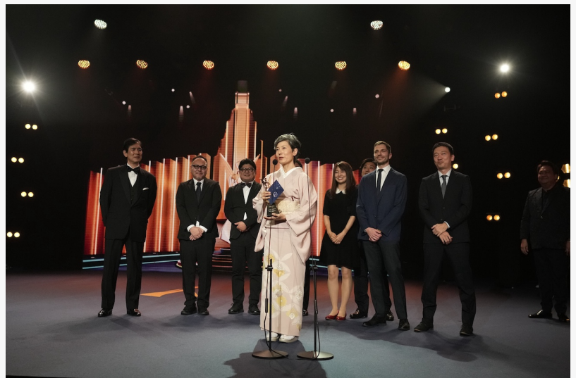
Fuji Television Japan accept the Asian Academy of Creative Arts Legacy Award

The highly prized Best Drama Series award went to Thailand's "Doctor Climax", by GMMTV for Netflix. The final margin was a mere 0.12 but the Thai series beat out 4 other top-ranking series