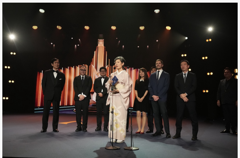
Fuji Television Japan accept the Asian Academy of Creative Arts Legacy Award

"City Hunter" won best Feature Film for Netflix and lead actor, Ryohei Suzuki created his own piece of history by claiming 2 statuettes (Best Actor in a Leading Role and Best Actor In A Comedy Performance). Previously, no actor or actress had ever won a second Goddess, but Suzuki was destined to re-write AACAs history books.