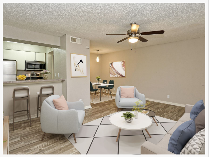
Cherrywood's kitchens provide an open layout that seamlessly flows into the spacious living room, perfect for both cooking and entertaining.