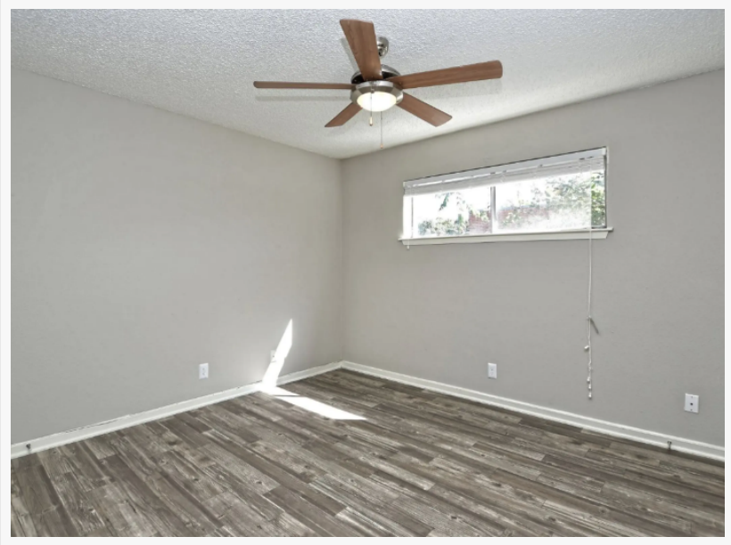
Experience the perfect blend of modern comfort with wood-style flooring, a sleek ceiling fan, and an open window that invites fresh air into every corner.

Located just minutes from downtown Austin, life at Alma Cherrywood offers residents the perfect balance of city living and a relaxed neighborhood feel. The Cherrywood area is known for its charming local eateries, lush parks, and tree-lined streets, creating an ideal spot for those who value a strong sense of community. Nature enthusiasts can explore the nearby Mueller Lake Park, while shopping and entertainment at the Mueller district