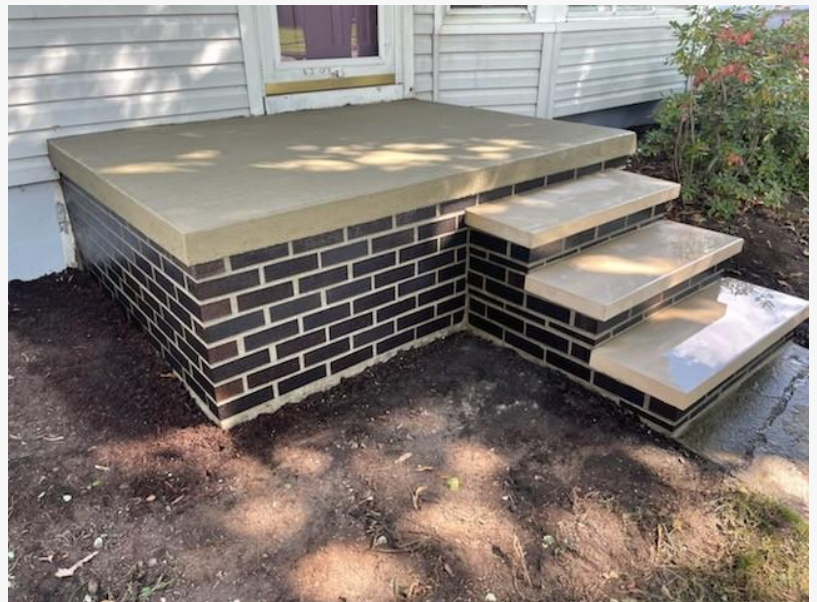
Steps Repair Services