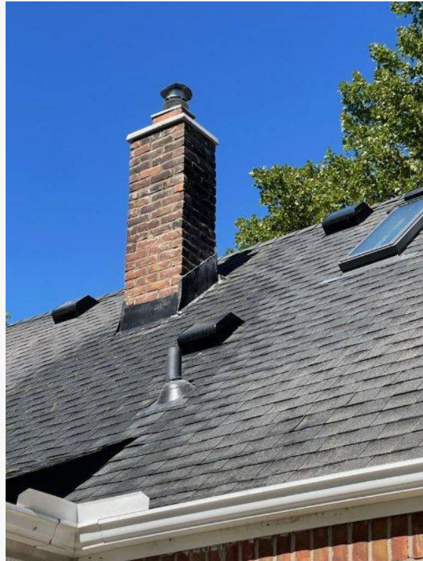
Chimney Services in Macomb