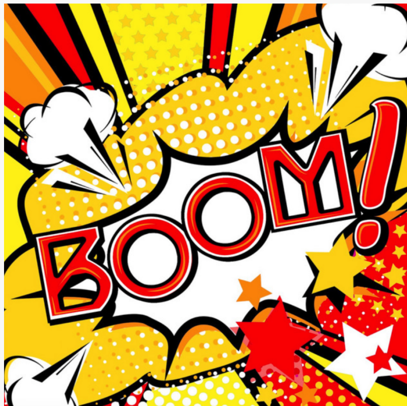
CHIEF "Boom", cover art

This press release can be viewed online at: https://www.einpresswire.com/article/766540489