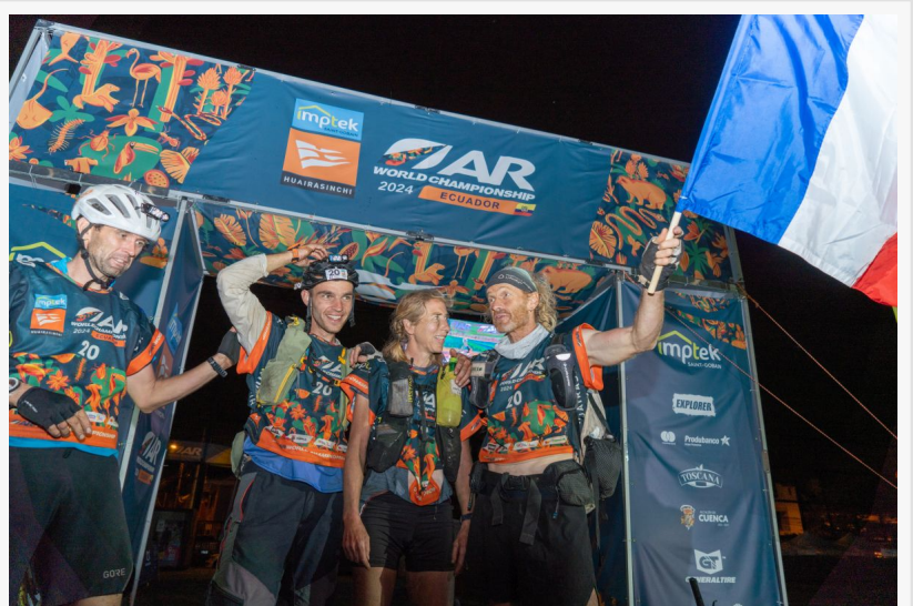
400team are the new Adventure Racing World Champions

Béranger said, "We slept only 2 hours in the race. We wanted to sleep, but we wanted to win even more."