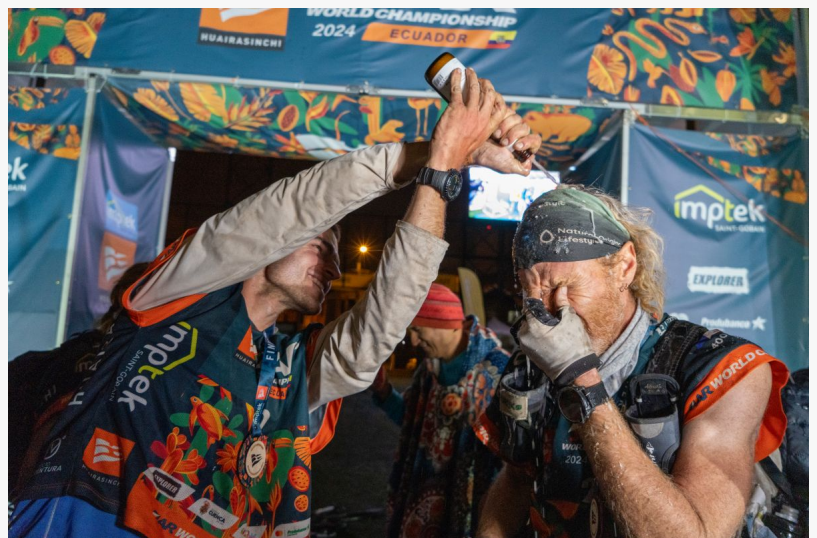
Champagne celebration for 400team