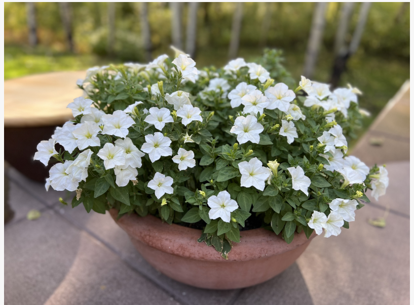
Firefly Petunia - Light Bio, Inc