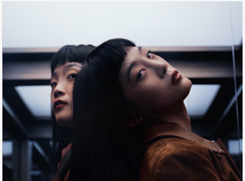
Best Designer & Contemporary Fashion: 'Life Has Many Paths', Coach