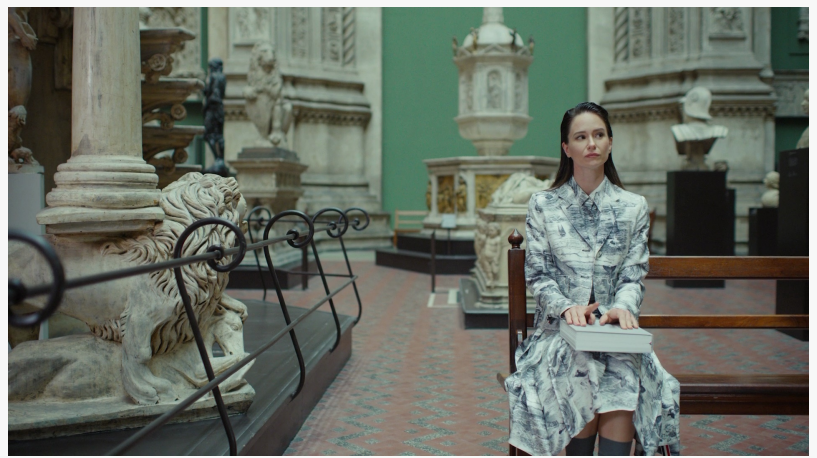
Best Designer & Contemporary Fashion: 'Night at the Museum', Thom Browne

contradiction inherent in the image of a black wool coat. On the one hand, it is a symbol of hiding and protection, on the other hand, the fabric gracefully fluttering in the wind is an image of freedom, protest and femininity. Our project is a low-budget, creative endeavor driven purely by the enthusiasm and initiative of a small team. It was such a joy to see this film alongside large-scale projects, and I am incredibly grateful that the jury recognized it!'