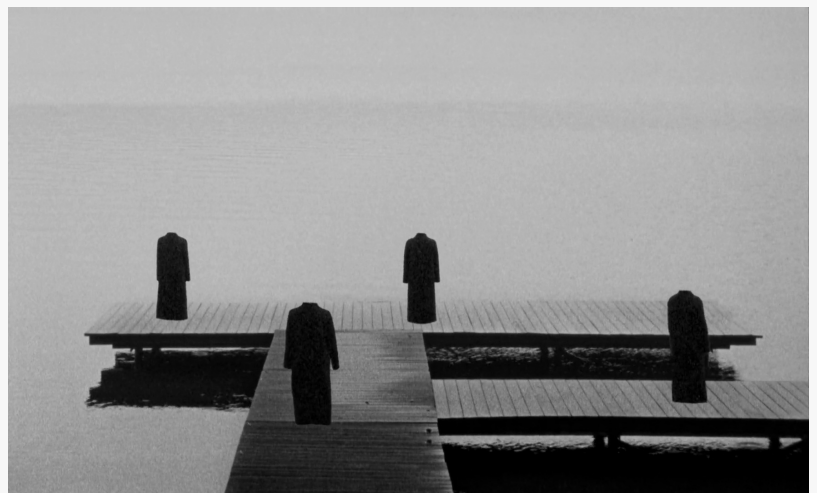
Best Independent, 'Blossoming Ones', Razumno