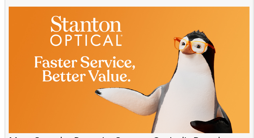
Meet Stan the Penguin, Stanton Optical's Brand Ambassador – Discover Unbeatable Offers at Stanton Optical Jonesboro Store Before They're Gone!