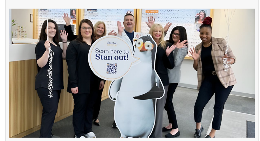
Stanton Optical Jonesboro Staff Celebrating Grand Opening Ceremony

Stanton Optical: We Make Eye Care Easy, Accessible, and Affordable for All