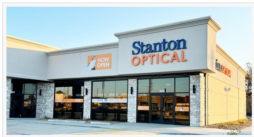
Stanton Optical Jonesboro - Your Ultimate Destination for Glasses, Contacts, and Sunglasses

JONESBORO, AR, UNITED STATES, December 12, 2024 / EINPresswire.com/ -- Stanton Optical, a pioneer in affordable and accessible eye care, announces the grand opening of its latest store in Jonesboro, AR on [December 2nd. This new addition at 2200 Red Wolf Blvd. Suite 300 Jonesboro, AR 72401 strengthens Stanton Optical's commitment to