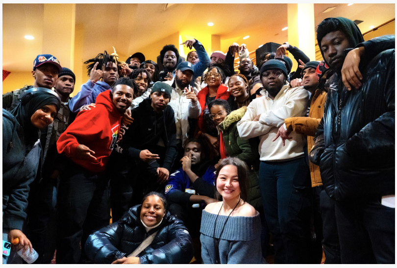
DreTL with NCEG Family