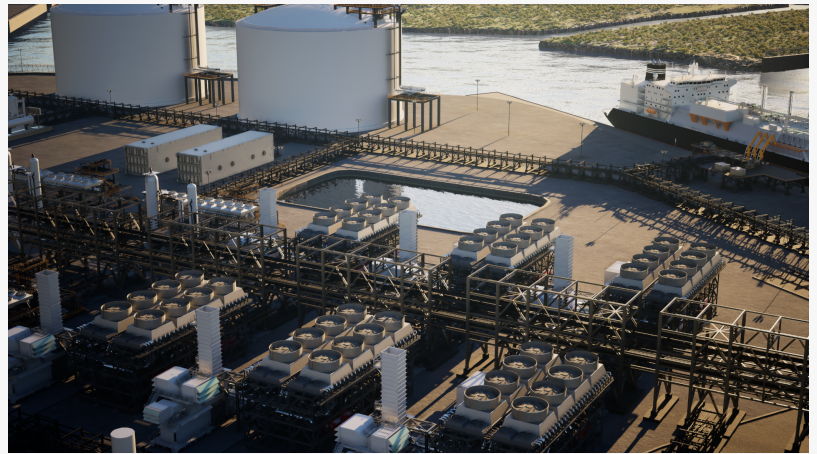
Argent LNG 6 Trains and Dock