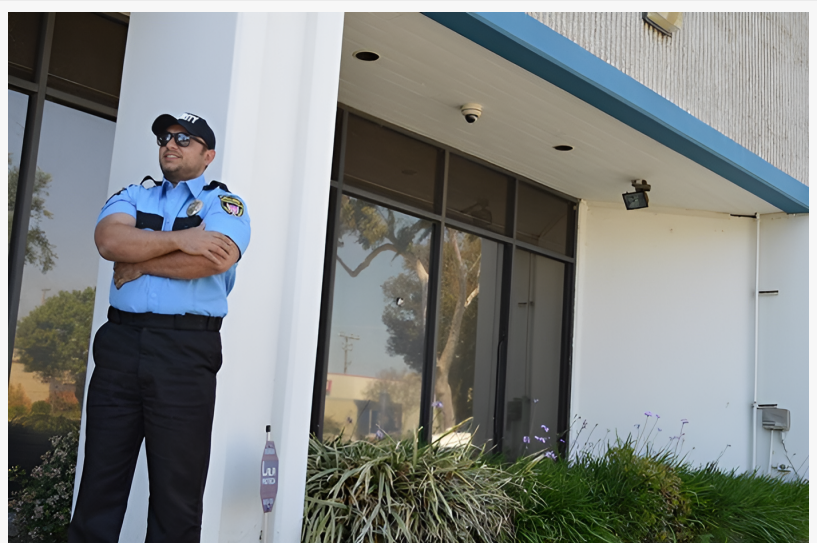
Security Guard Services

In response to the growing demands for safety, the professional security guard industry has seen a sharp rise in Los Angeles. As the city continues to grow both in population and in economic importance, ensuring the protection of individuals, properties, and businesses has become more critical than ever before. Whether it's safeguarding corporate buildings, protecting high-profile individuals, or managing the risks at construction sites, security patrol services in Los Angeles have become integral to the fabric of daily life. Construction site security guards , in particular, are essential to prevent theft, trespassing, and ensure the smooth operation of ongoing developments in the city.