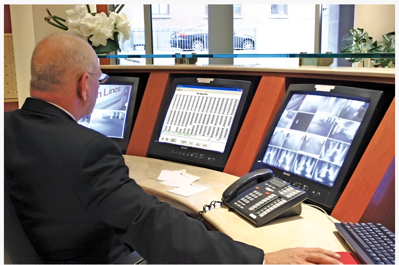
Corporate Building Security Guard

Security patrol services in Los Angeles are designed to be proactive rather than reactive. Gone are the days when security was just about showing up and waiting for something to happen. Security guards today are trained to anticipate threats and prevent them before they escalate.