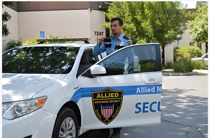
Security Patrol services