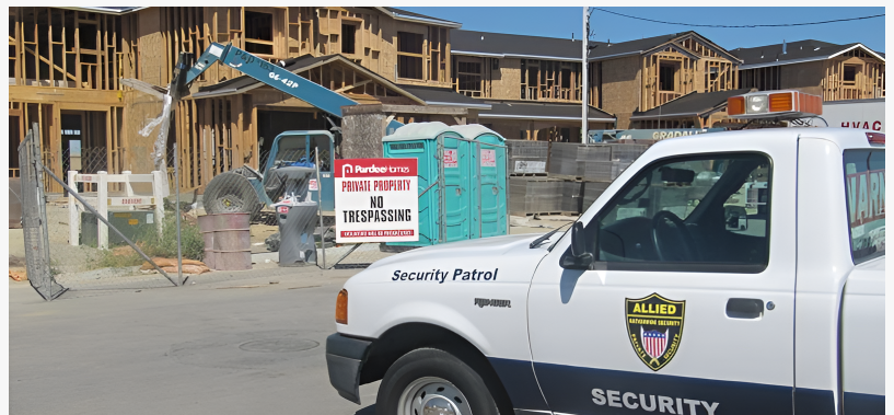
Construction Site Security Guard

Understanding the Growing Demand for Security Guards in Los Angeles