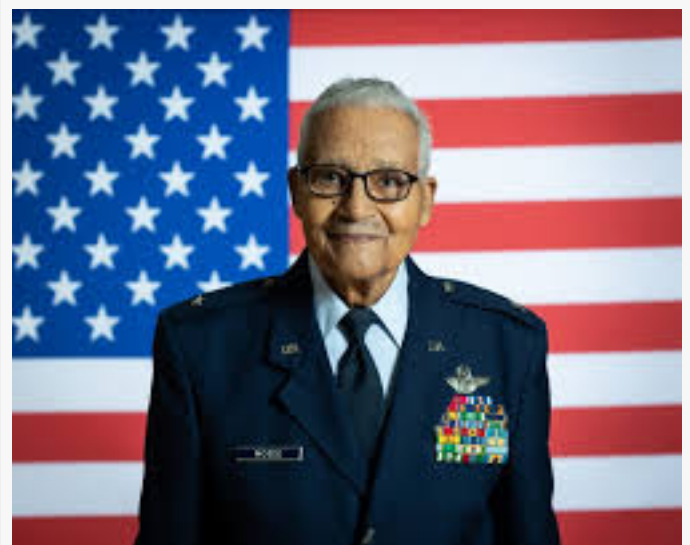
Brigadier General McGee

SILVER SPRING, MD, UNITED STATES, December 6, 2024 /EINPresswire.com/ -- Alpha Phi Alpha Fraternity Inc., Iota Upsilon Lambda Chapter in Montgomery County (MD), a demonstrated community service leader and visionary, is soliciting contributions for the Alpha Brigadier General Charles McGee STEM Scholarship . To donate text STEM1906 to 44321 or visit www.CharlesMcGeeSTEM.org .