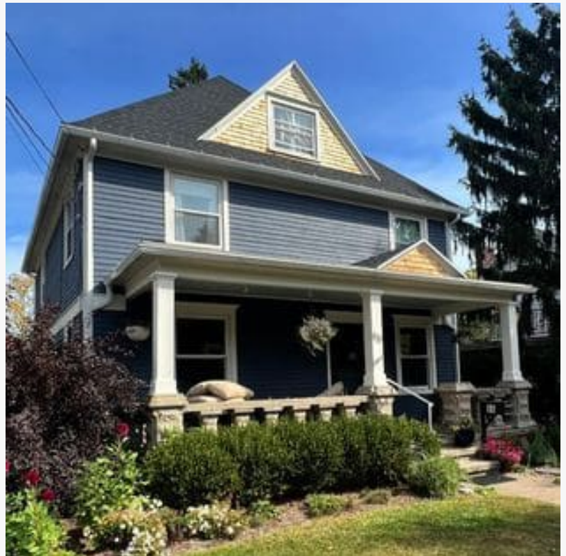
Exterior Painting Rochester

The company also emphasizes sustainability, integrating eco-friendly products and practices into its operations to minimize environmental impact.