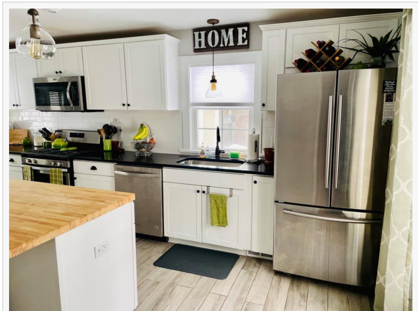
Cabinet Painting Rochester

Ongoing professional training and adoption of the latest techniques