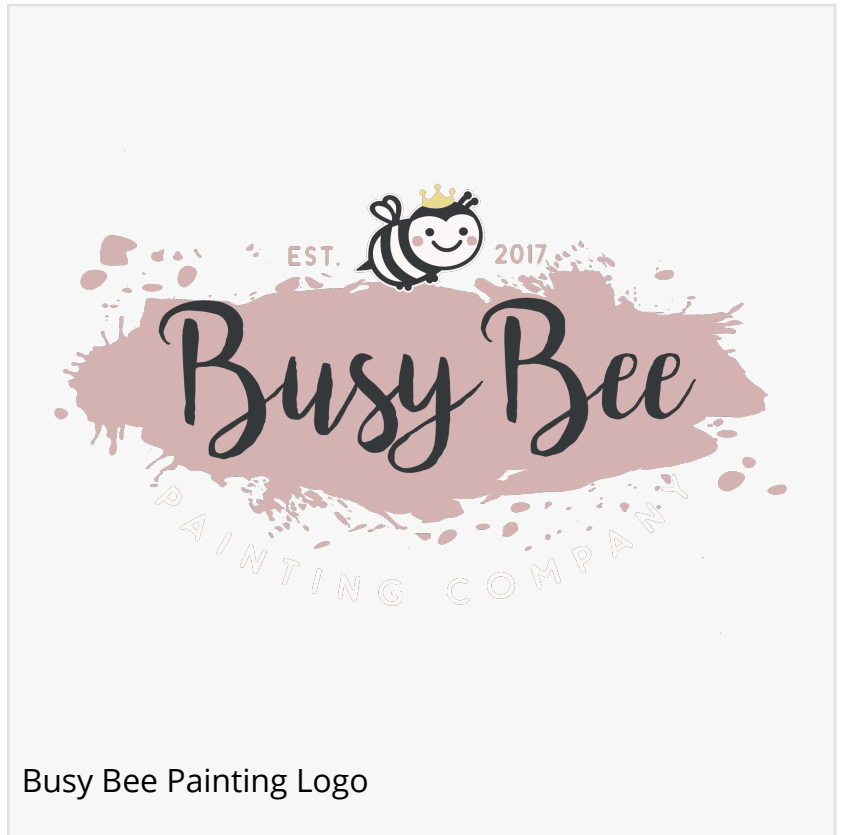
Busy Bee Painting Logo