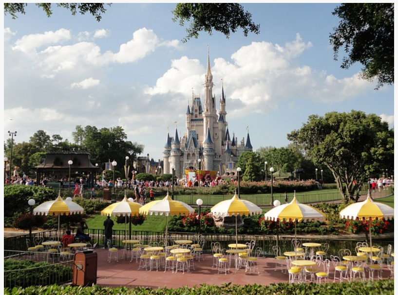
Disneyland turns 70!