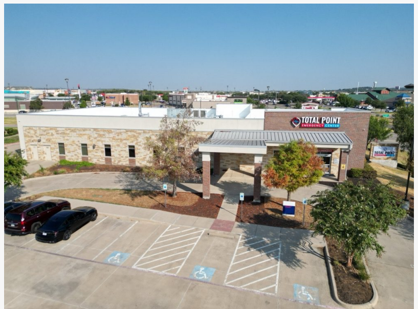
Total Point ER reopens in Burleson Texas