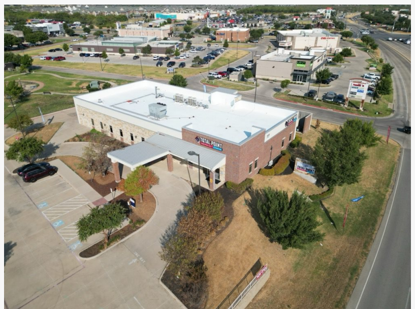
Total Point ER in Burleson Texas located at 300 SE John Jones, Burleson, Texas 76028

"Our mission is rooted in the belief that exceptional healthcare should be readily available to all Texans, regardless of where they live," said Total Point Healthcare Spokesperson. "This facility symbolizes progress, preparedness, and hope for the Burleson community."