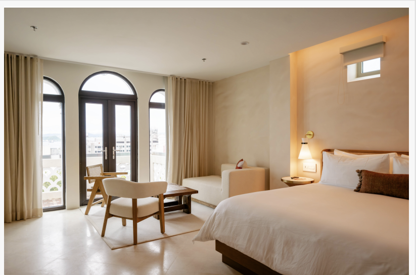
Lang & Schwander - Alma

The oceanfront Windsong on the Reef in Providenciales, Turks & Caicos, is an 85-key beachfront luxury property located directly on Grace Bay Beach and the Bight Reef. It is comprised of the Windsong Resort, an existing 36-key building and a new building with 49 keys -the Windsong Residences - which