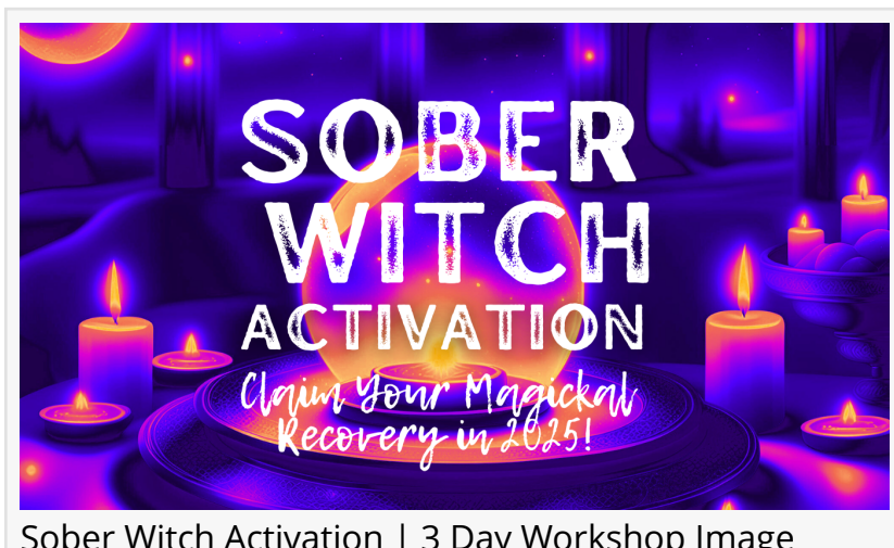
Sober Witch Activation | 3 Day Workshop Image

DETROIT, MI, UNITED STATES, December 9, 2024 /EINPresswire.com/ -- Illuminate: The Unschool Of Sober Witchcraft is excited to announce its upcoming 3-day Sober Witch Activation Workshop, running from January 2nd to January 4th, 2025. This transformative workshop is designed