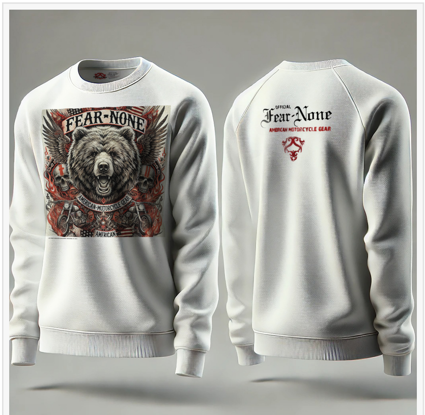
FEAR-NONE motorcycle clothing's American Legends Campaign shirt

FEAR-NONE's "American Legends Aren't Born... They Are Earned" campaign kicks off on December 1st, 2024, with exclusive product launches, events, and promotions. From Chicago to the rest of the world, FEAR-NONE invites riders and enthusiasts to celebrate what it means to be a true American legend.