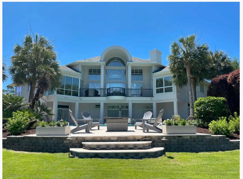
Exterior Painting Myrtle Beach