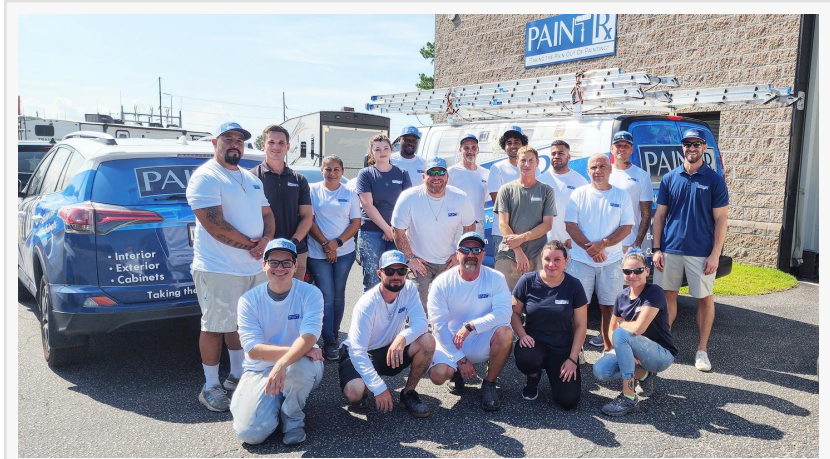
Paint Rx Team

EINPresswire.com/ -- Paint Rx , the trusted name in professional painting services across South Carolina's coastal communities, today announced the launch of its completely redesigned digital presence at paint-rx.com , marking a significant milestone in the company's evolution since its founding in 2018.