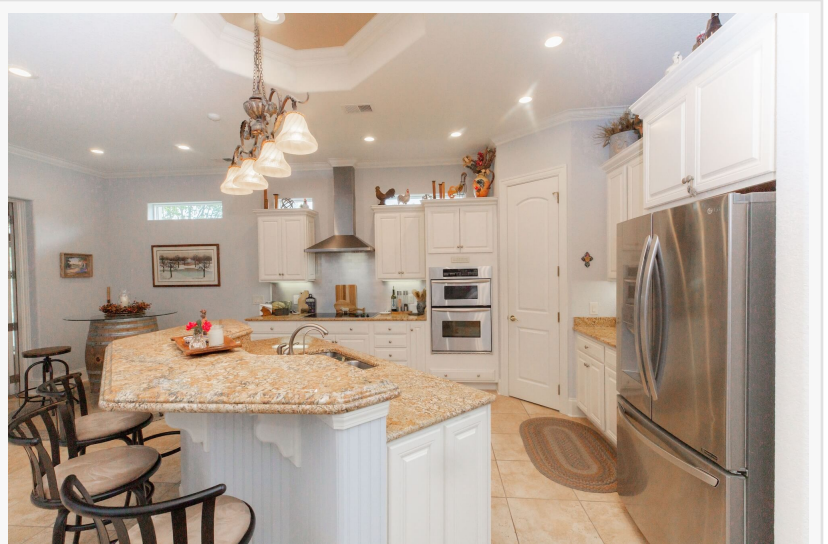
Cabinet Painting Myrtle Beach