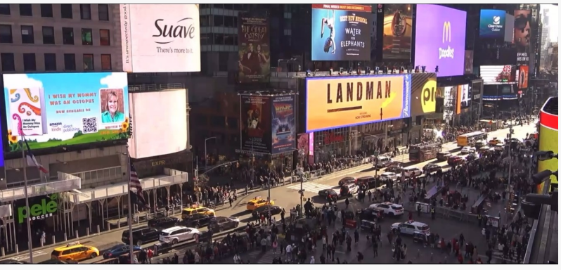
Book 'I Wish My Mommy Was An Octopus' Featured on Time Square

I Wish My Mommy Was An Octopus Book Cover