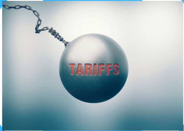
New Trade Tariffs