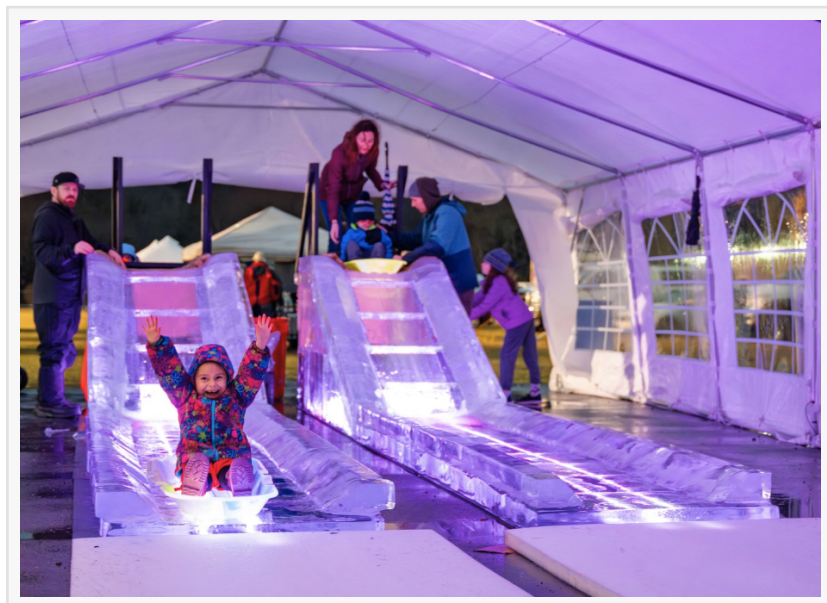
Little girl zooming down slide made of ice for the 2024 Ice Festival

These being the key ingredients for their frosty operation left them in a bit of a puddled mess. The team at Ice Mill