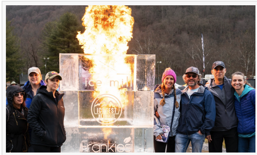
Festival Goers Enjoying the short blast of heat from an ice sculpture tower with fire inside.

The event is made up of several winter themed events hosted all around Haywood county, but the crowds come to see the ice! The team has already began work on the list of clear attractions including 2 giant ice slides that visitors can sled down that hit a top speed of nearly 20 miles per hour. They are bringing back a giant ice