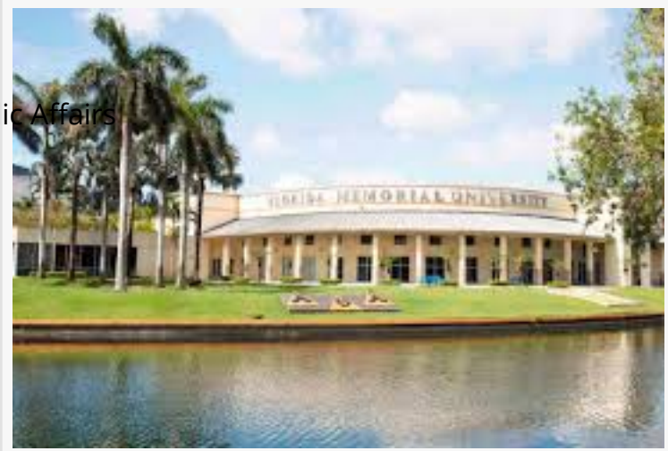
Smith Conference Center

This press release can be viewed online at: https://www.einpresswire.com/article/766994937