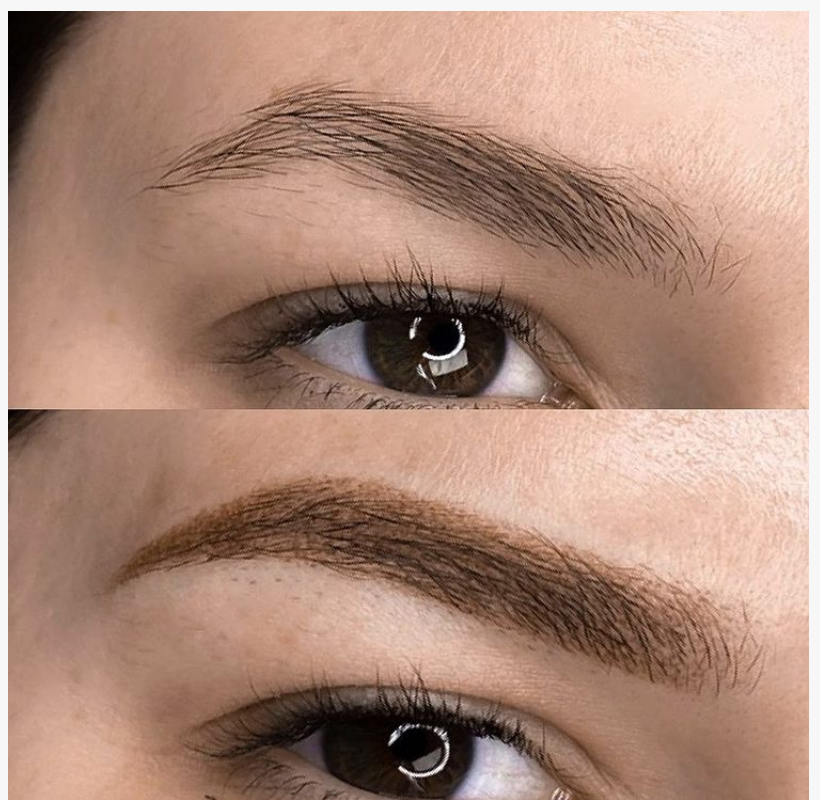
eyebrow microblading michigan

To celebrate the opening, Fine Strokes Microblading is inviting community members to visit the new studio and learn more about their services. Special events, including complimentary consultations and exclusive discounts, will be available throughout the month of December.