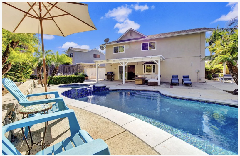
Still Water Wellness Has Unique Amenities for its Patients

Dedicated Staff: A team of highly skilled professionals, including physicians, therapists, and support staff, provide round-the-clock care, ensuring a personalized and attentive recovery experience.