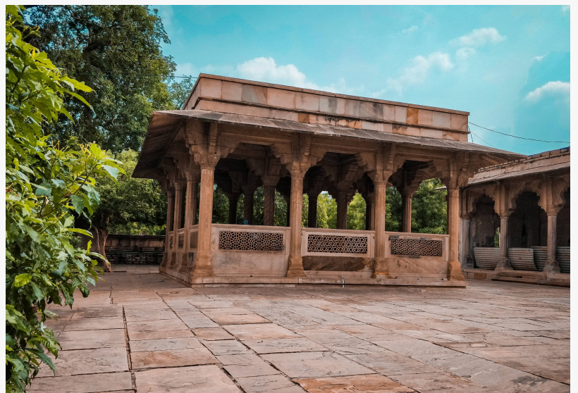
Resting place of the musical legend - Tomb of Tansen