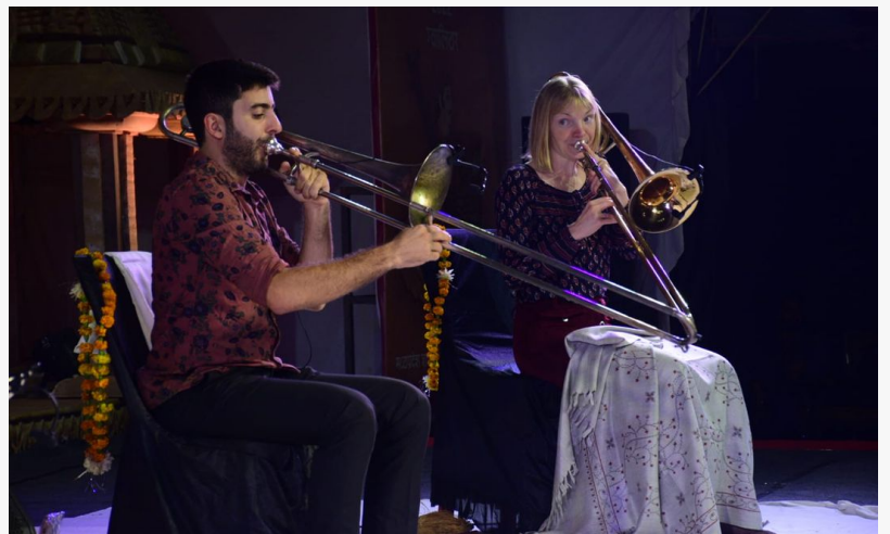
Musical Performance by Foreign Artists at last years Tansen Samaroh