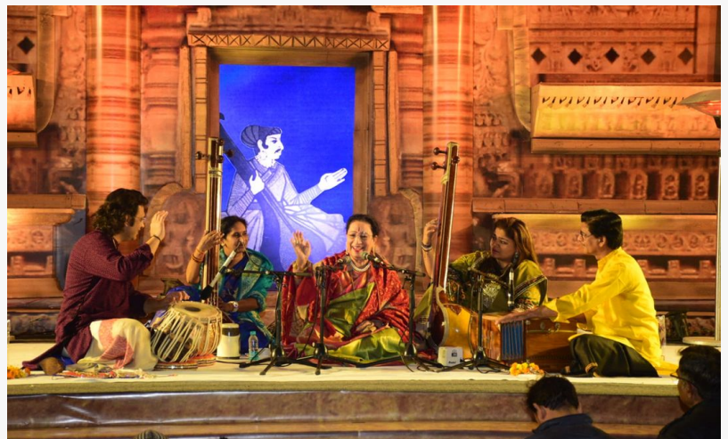
A glimpse of the past Tansen Samaroh performances