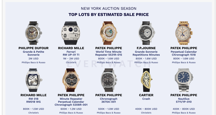
EveryWatch New York 2024 Watch Auction - Top Lots by Estimate Sale Price