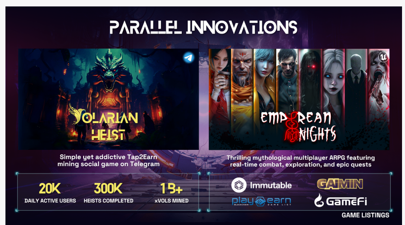
Parallel Innovations: Volarian Heist and Empyrean Nights