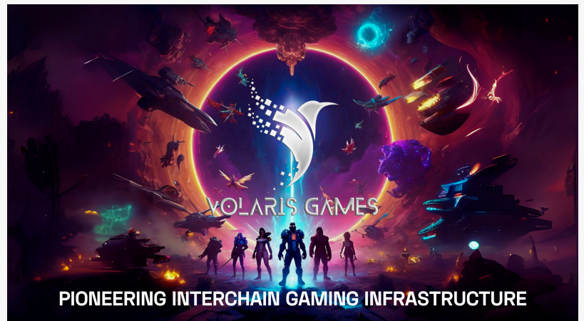
Pioneering Interchain Gaming Infrastructure

EINPresswire.com/ -- Volaris Games , the pioneering interchain gaming infrastructure provider, is excited to announce its upcoming Token Generation Event (TGE) and launchpad sales. With a mission to unify the fragmented Web3 gaming landscape, Volaris Games is set to redefine gaming infrastructure by delivering cross-chain interoperability and innovative gaming solutions.