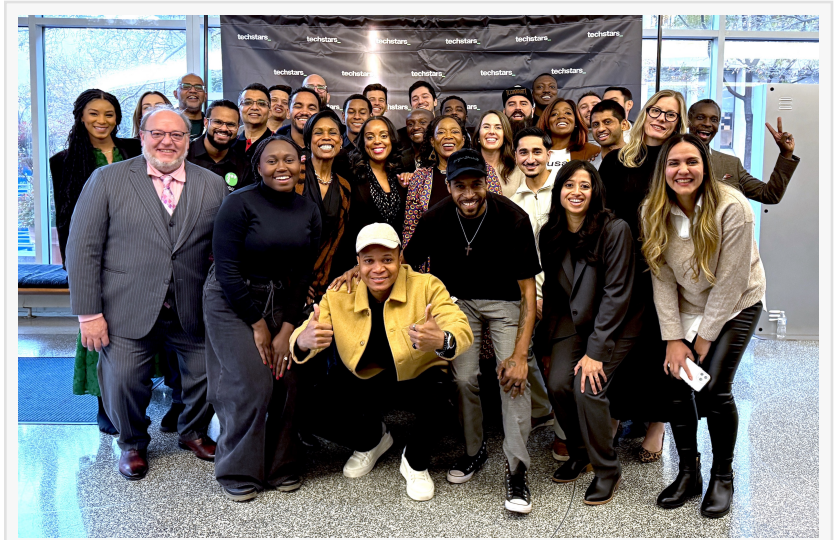
Techstars '24 Cohort