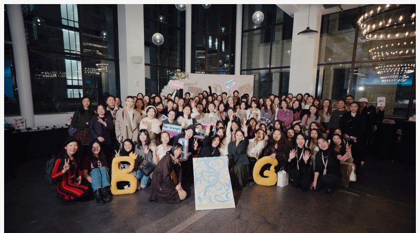
Bonjour Girls 2024 Annual Social Event: A moment of unity and celebration as speakers, panelists, and attendees come together to empower and inspire Asian women.