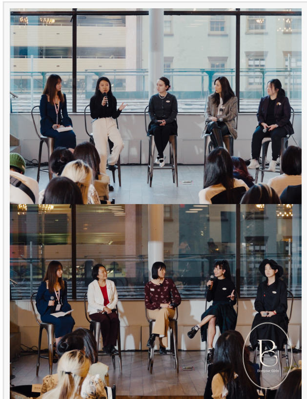
The panelists passionately share her insights during the Bonjour Girls 2024 Annual Social Event, inspiring discussions on leadership and empowerment for Asian women