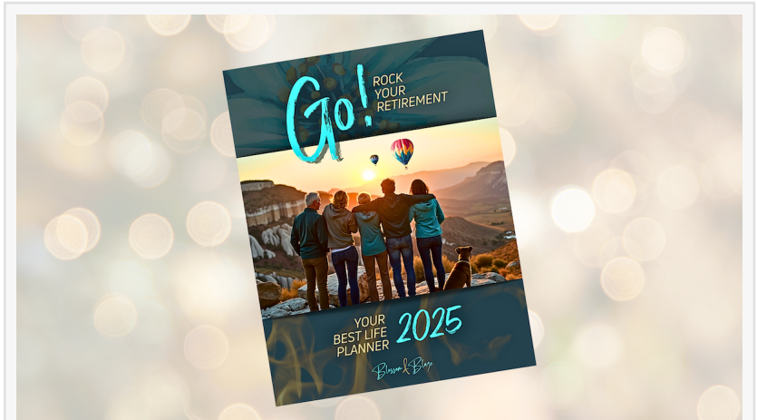
"Go! Rock Your Retirement: Your Best Life Planner 2025"

usual assortment of mugs, plaques and clocks for the retirees in their lives. Enter "Go! Rock Your Retirement: Your Best Life Planner 2025" by Blossom & Blaze — a holistic planner-workbook that redefines retirement planning and offers retirees a roadmap for living with joy, vitality and intention.