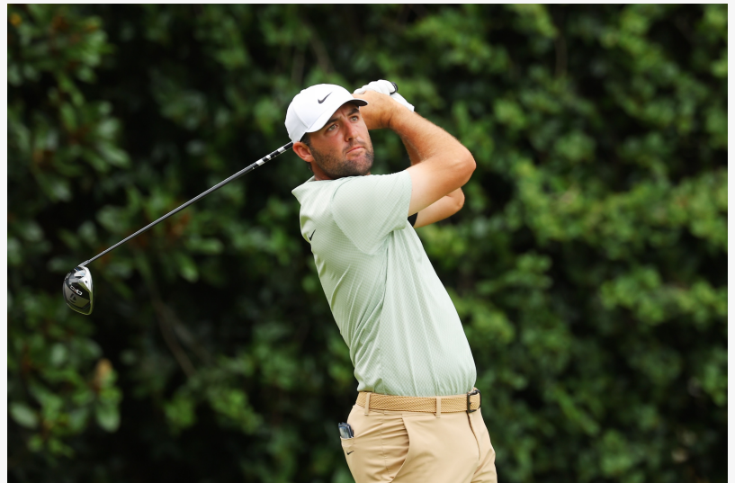
Scottie Scheffler, the No. 1-ranked player in the Official World Golf Ranking