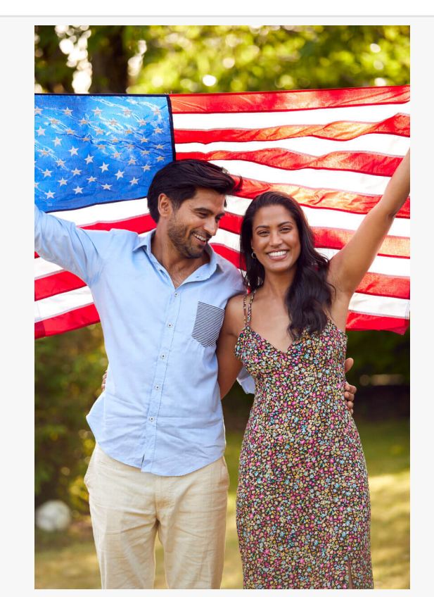
EB5 Green Card, EB5 Regional Center

https://globalimmigration.com/services/e2visa/