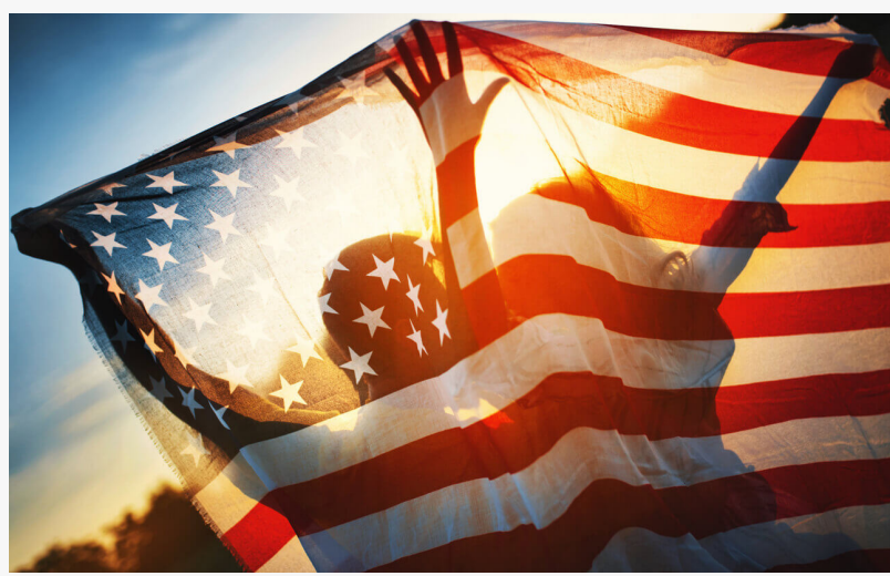
EB5 Green Card, EB5 Regional Center