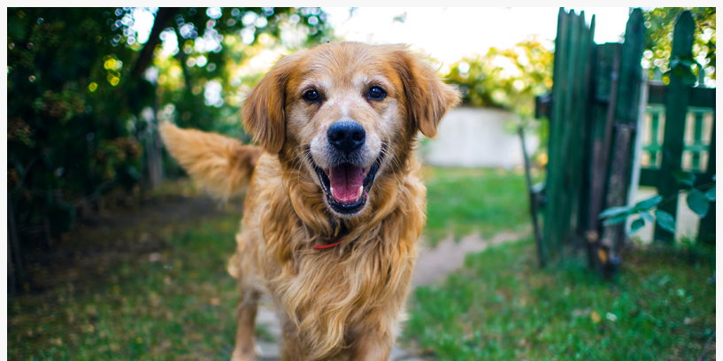
Sparkle Fetches Top Dogs and Heads to the Buckeye State.